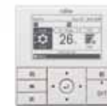
Wired Remote Controller (High grade)