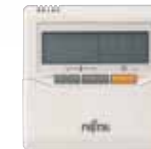
Wired Remote Controller