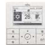
Wired Remote Controller (High grade)