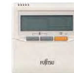
Wired Remote Controller